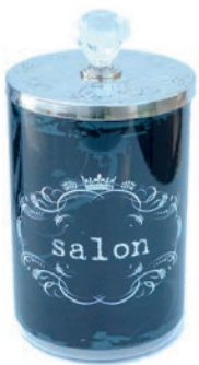
Urban Chic 6610