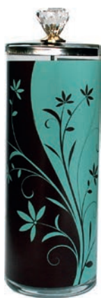
Split Personality 5341