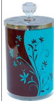
Split Personality 6609