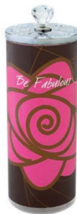
Be Fabulous 6083