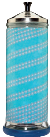
Ocean Bling 9298