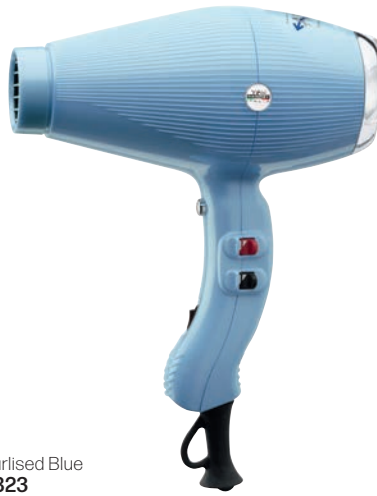
Pearlised Blue 15823