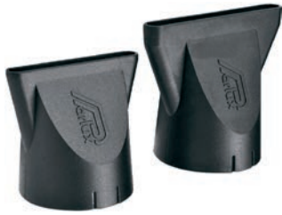
Spare Advance Nozzles, 2 Pack (Large & Small) 13692