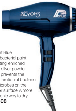
Night Blue Antibacterial paint coating, enriched with silver powder that prevents the proliferation of bacteria & microbes on the dryer surface. A more hygienic way to dry. 16608