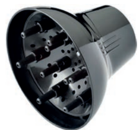
Parlux Alyon Diffuser 14634