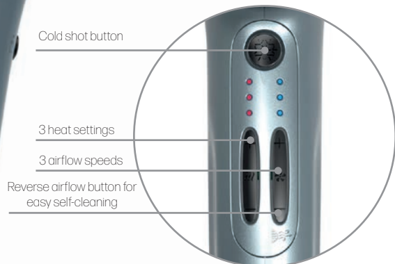
Cold shot button 3 heat settings 3 airflow speeds Reverse airflow button for easy self-cleaning