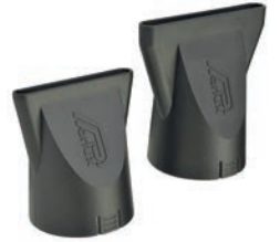
Spare Nozzles, 2 Pack (Large & Small) 13689