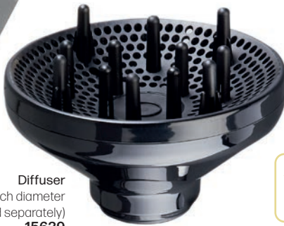
Diffuser Snap-on, 5 inch diameter (sold separately) 15639