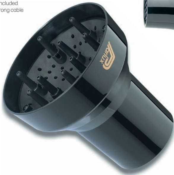
Diffuser for Superturbo HP 15630