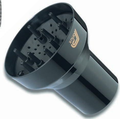
Diffuser for 3200 PLUS 15630