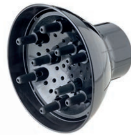
Diffuser for 385 Powerlight 9346