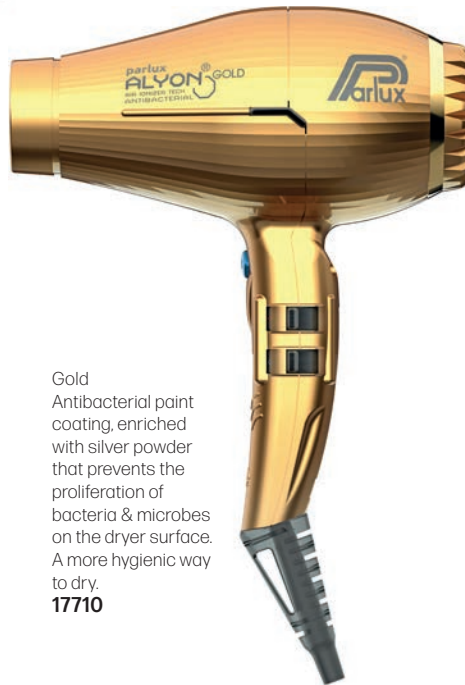
Gold Antibacterial paint coating, enriched with silver powder that prevents the proliferation of bacteria & microbes on the dryer surface. A more hygienic way to dry. 17710