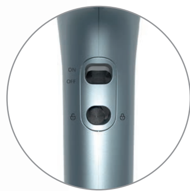
Lock button conveniently locks settings while in use

2 Comb Attachments (Single & Double Row), Concentrator Nozzle & Cleaning Brush 19089