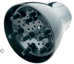
Diffuser for 3800 5760