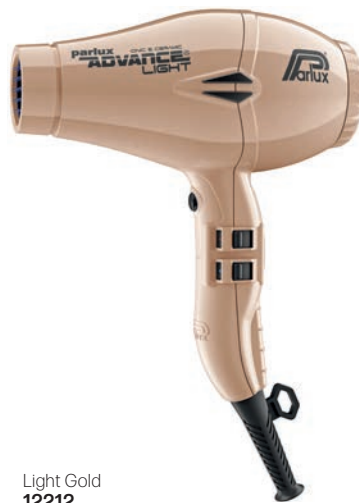
Light Gold 12212