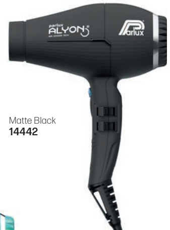
Matte Black 14442