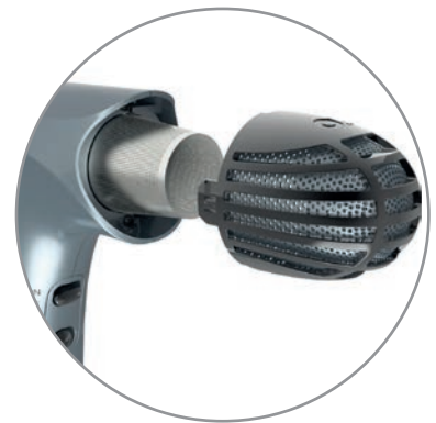
Unique dual filter design for ultimate motor protection. Removable back filter to easily clean internal filter with total 360° access. Cleaning brush included.