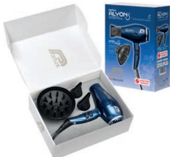
Night Blue Dryer & Diffuser Set 16609