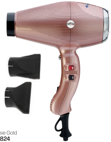
Rose Gold 15824