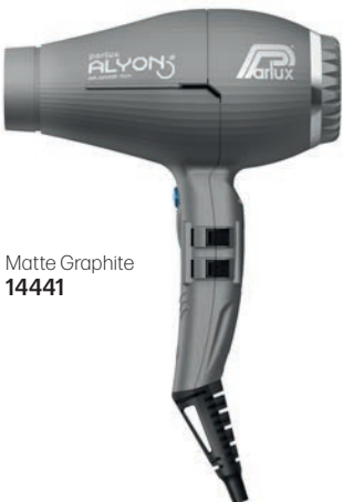
Matte Graphite 14441