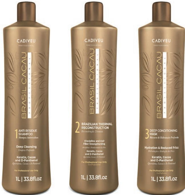
Step 1 Anti-Residue Shampoo 1 Litre P997

Professional Kit Step 1, 2 & 3 Includes 3 x 1 Litre P999