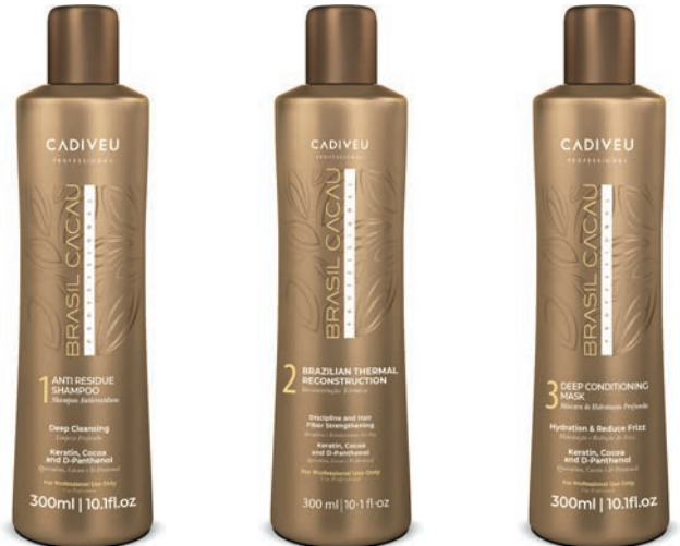
Step 1 Anti-Residue Shampoo 300ml P982

Professional Kit Step 1, 2 & 3 Includes 3 x 300ml P977